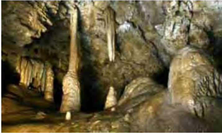
Oregon Caves National Monument cave tours.