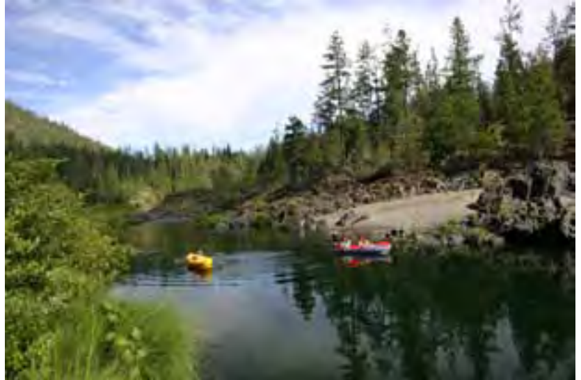
Wild and Scenic Illinois River near Little Falls Loop Trail.

Trail is located on Eight Dollar Mountain Road about two miles from Highway 199.