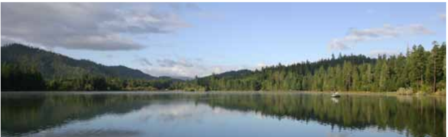
Lake Selmac County Park, Selma, Oregon

Three furniture produce distinctly unique furniture styles from rustic, to precision, and abstract.