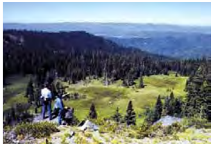
Bigelow Lakes Loop Trail near Oregon Caves.

Black Butte Road ends at the trailhead into the Siskiyou Wilderness. A road guide can be found on Highway199.org .